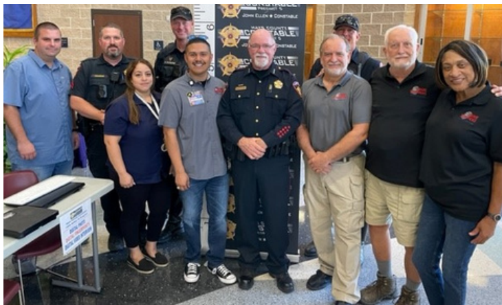
The HCCS Team with members of the Hays County Constable Pct. 5 office.

Have a tip? Students and community members are encouraged to call our Crime Stoppers Tip Line (800-324-8477) or submit a tip on the P3 App to report illegal activity or provide information that could lead to an arrest.